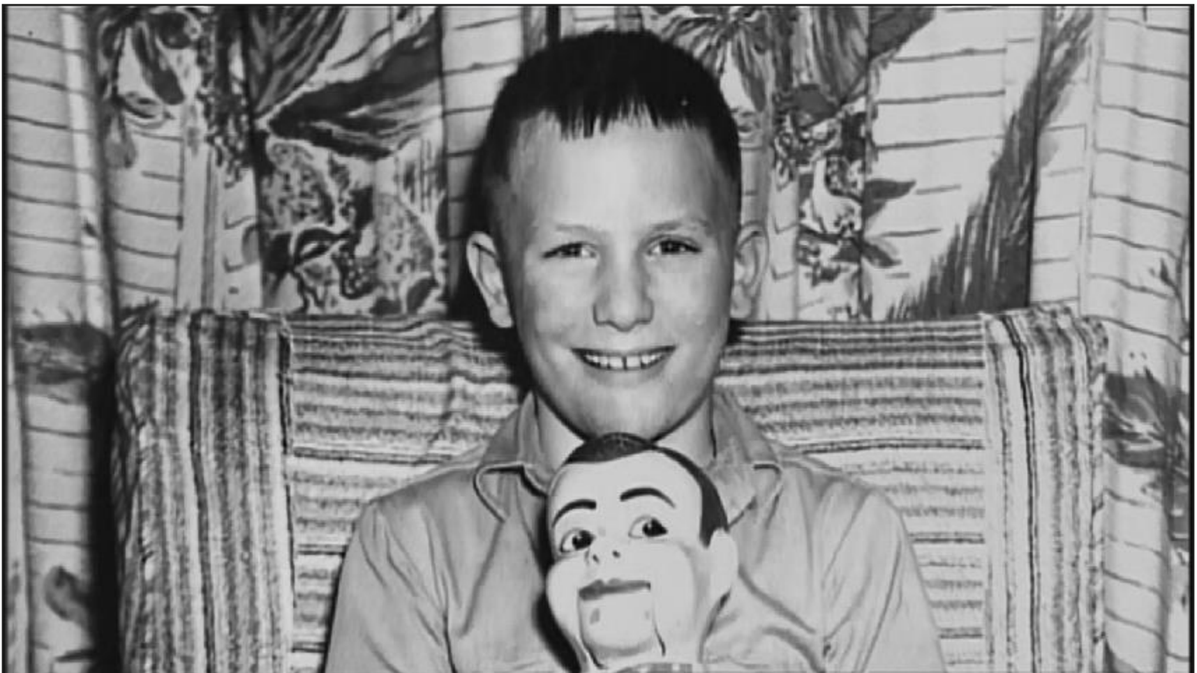
I became a Carville patient during my fourth grade school year